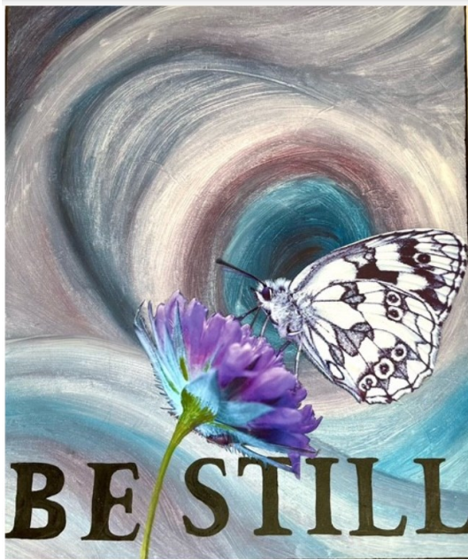
1) Be Still, mixed media , Joy Hadley