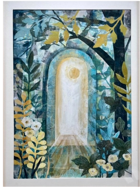
2) Gelli printing collage by Sue Harris